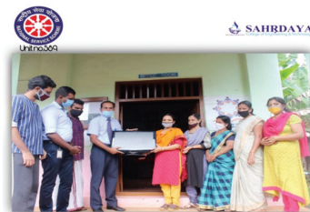
ഓരോ മാറ്റിമരിക്കാൻ നിങ്ങൾക്ക് ഉപയോഗിക്കാവുന്ന ഏറ്റവും ശക്തമായ ആയുധമാണ് വിദ്യാഭ്യാസം!