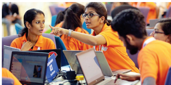
KERALA HACKATHON 2020